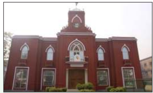
The refurbished Assembly Hall... Centrally airconditioned!!