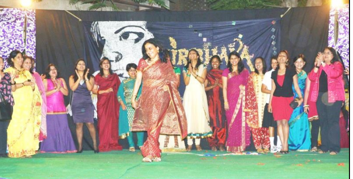
Ex-Snowies shining on the stage!