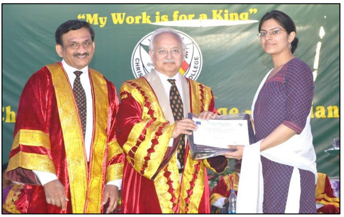
The Hallowed Grounds

Remember today, for it is the beginning of a new time - Dante Alighieri.