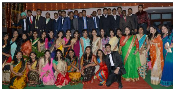
Batch of 2010