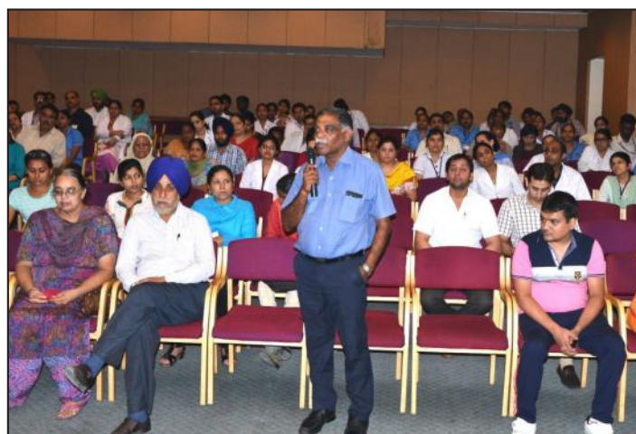
One of the stroke survivors sharing his experience of receiving rtPA when he had a stroke