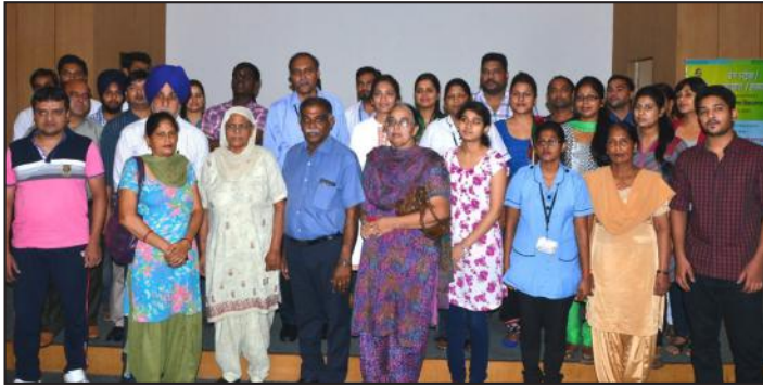
Stroke Patients who received rtPA with the members of Stroke team