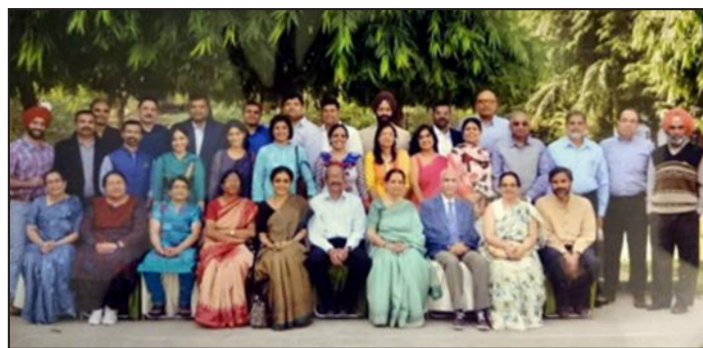
Batch of 1989: Reunion with Teachers on 15 th Nov.- 2014 on completing 25 years of joining MBBS course.