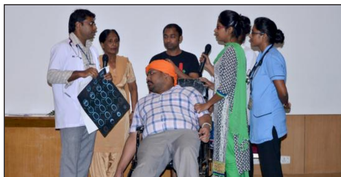
Play enacted by the Nurses in the stroke unit

The nurses of the stroke unit enacted a skit emphasising on the awareness of stroke symptoms and early arrival to the hospital.