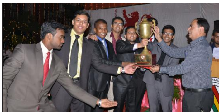
Champions Trophy- Batch of 2010